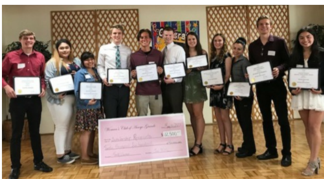
Congratulations to all of our Scholarship winners!